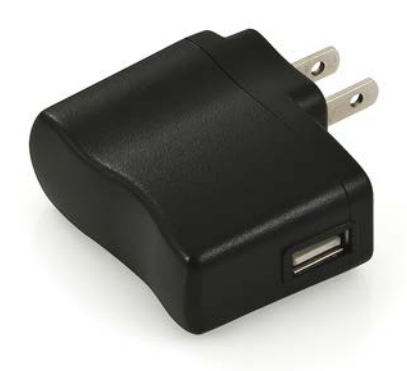
USB Power Adapter (2444B6)

Works with Mini Remote and any other device that uses USB Type A to Micro-B