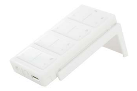
Tabletop Stand (in 2444BWH kit)

Perfect for a nightstand, kitchen counter or coffee table