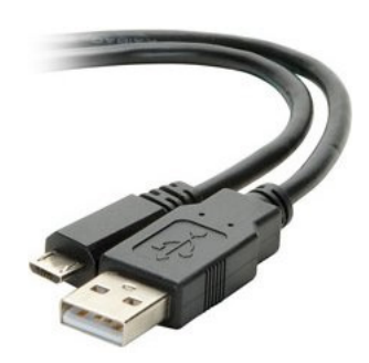
Type A to Micro-B cable (2444B5)

A Type A to Micro-B USB cable to connect and recharge Mini Remote using a computer or USB power adapter